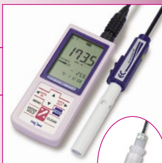
Electrical conductivity cell for pure water

Make sure to select the one that best fits your needs.